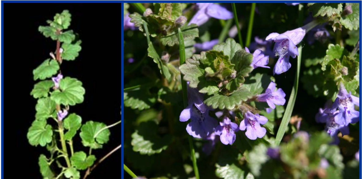
Creeping Charlie produces kidney-shaped leaves with scalloped edges on creeping stems (left) and small, bluish-purple, funnel-shaped flowers (right).

What does creeping Charlie look like? Creeping Charlie produces bright green, round or kidney-shaped leaves that have scalloped edges. The leaves are produced opposite each other on square (i.e., four-sided), creeping stems that root at the nodes. In spring, small, bluish-purple, funnel-shaped flowers appear. When the plant is crushed, it produces a strong mint-like odor. Creeping Charlie is often confused with henbit ( Lamium amplexicaule ), which is a winter annual.